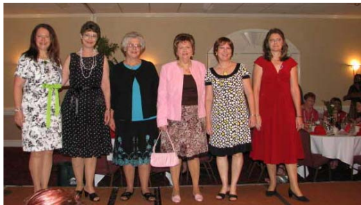
2009 Fashion Show Models

This is a monthly newsletter to keep you updated on projects and initiatives of the Pinellas Education Foundation. Please forward this to anyone you feel would be interested in learning more about the Pinellas Education Foundation.